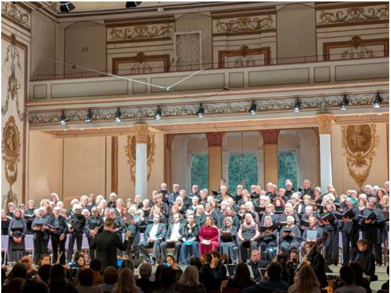
Choir of the Earth in Vienna

I had the most thrilling and thoroughly enjoyable trip to Vienna recently to sing Haydn's 'Missa in Angustilis' or 'Mass for troubled times' in the resplendent Esterhazy Palace where Haydn spent many years composing and performing his work. He wrote the Mass in 1798 when the world was in turmoil and Napoleon and his French forces were waging war against Austria. Then on the 15 th September, the day of the very first performance, it was learned that Napoleon had been defeated by a British fleet led by Horatio Nelson at the Battle of the Nile in August 1798. The Mass was thereafter known as the Nelson Mass.