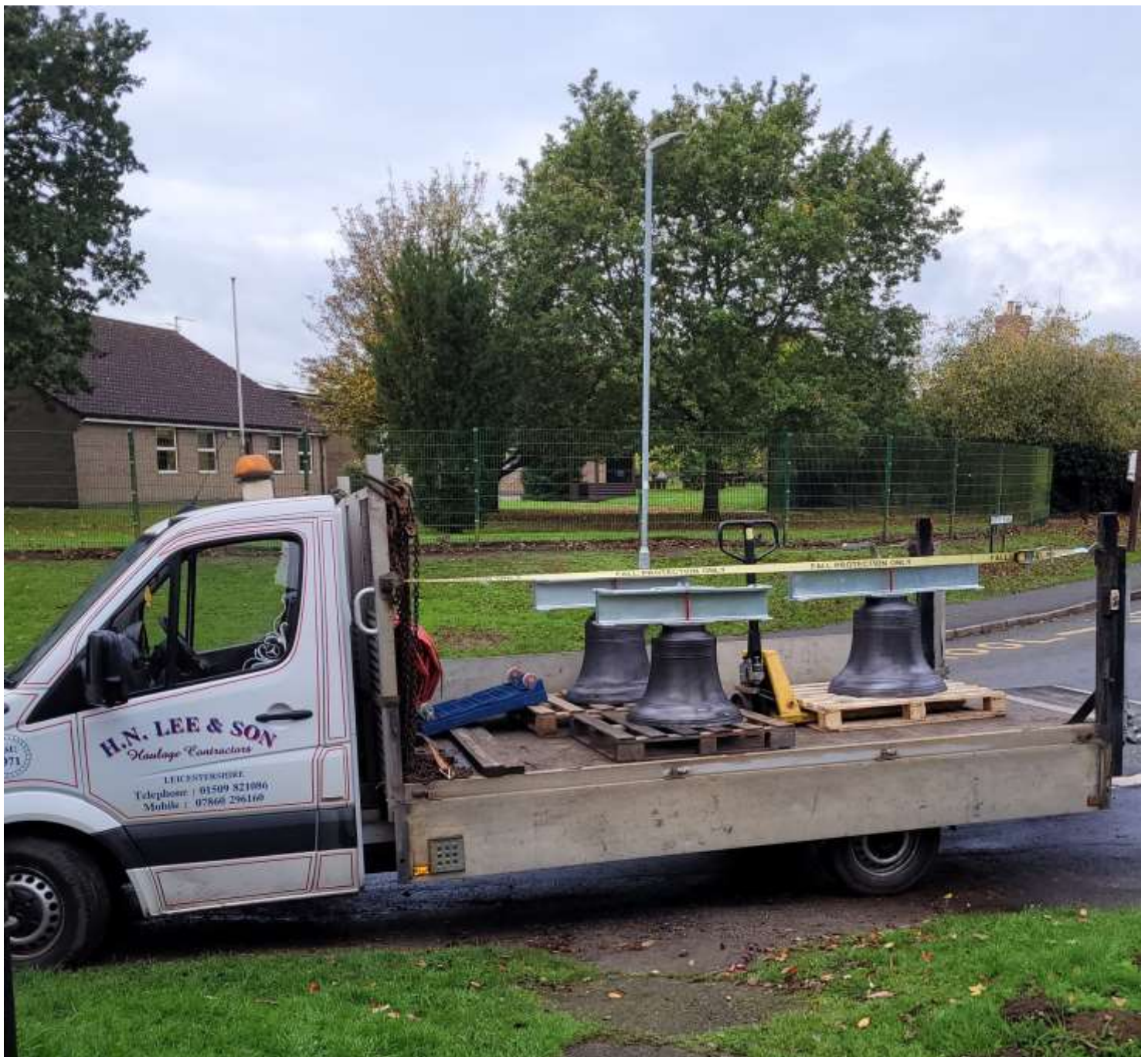
The Three Additional Bells Arrive at St Mary's Tetford at 9.30am on Tuesday 21 st October 2025